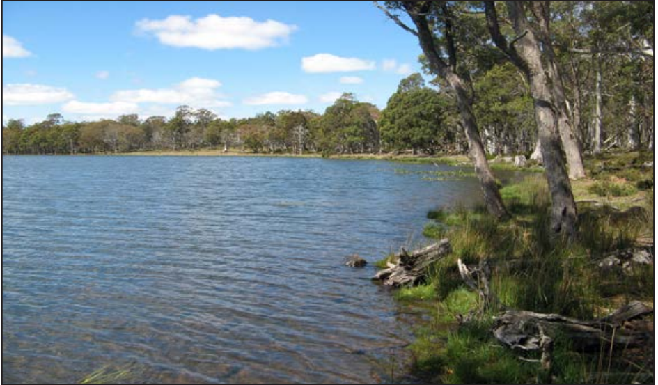
Penstock Lagoon – a justifiably famous Tasmanian fishery