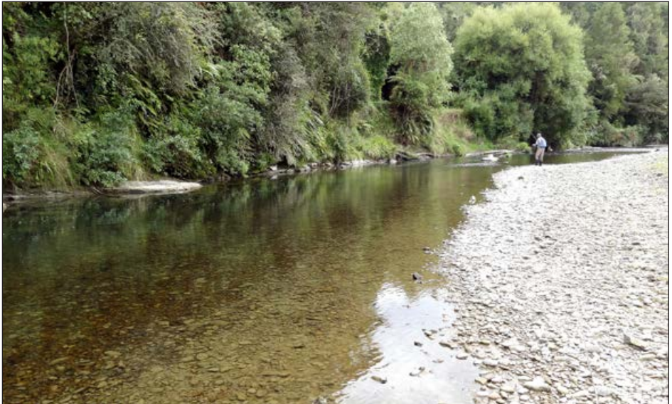
A top New Zealand stream with trout being very easy to spot in the clear water