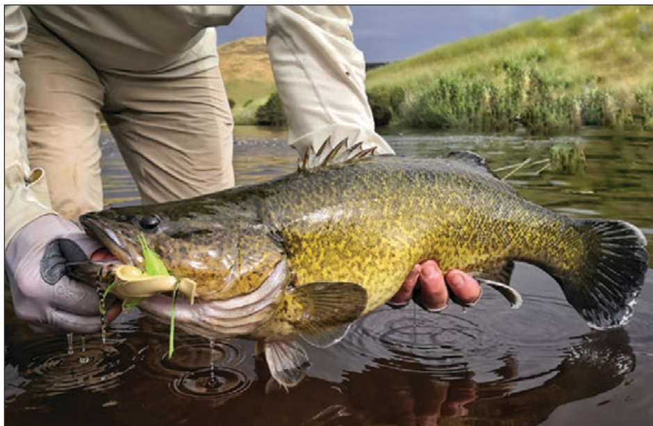
Cod are such a beautiful fish

Remember, if you can get a half decent cast with a fairly large air resistant fly then that's the key. It needs a nice firm stop to get the line to roll out. Probably the biggest thing I see with people when they are fishing for cod is that they struggle with casting. It doesn't matter if they've got the right line and right rod, because more often than not they've gone too long with their leader and thus they're turning that air resistant fly into a bit of a parachute.