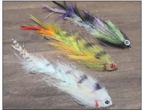
Three of Cameron's cod patterns

But in somewhere like Eildon, if those eggs hatch out successfully the missing ingredient is that there's actually very little chance that the plankton that these tiny little cod need to feed on when they