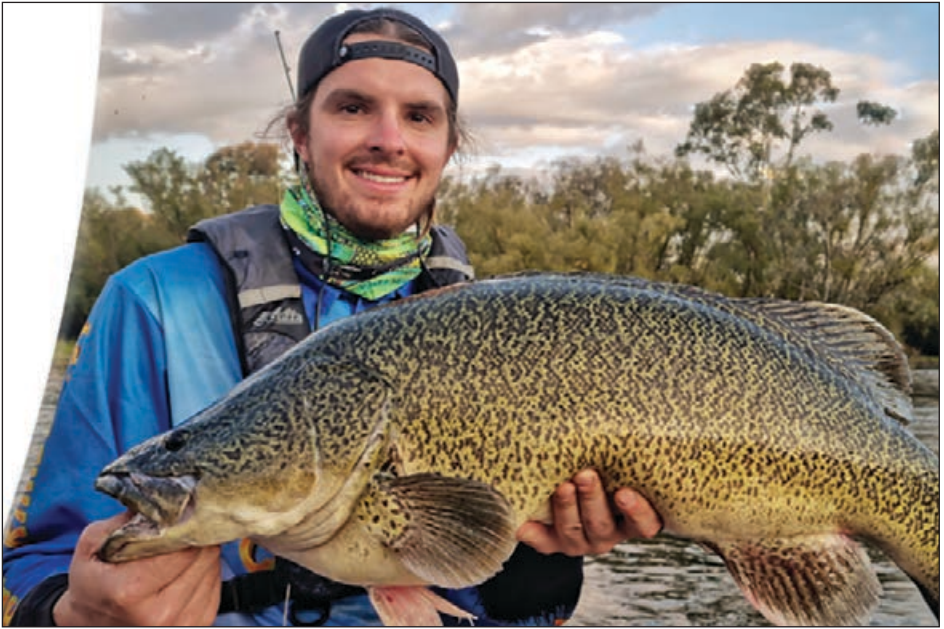
A Murray cod approaching a metre. Let's go!

closed season. But places like Eildon and Nillahcootie have come online, and you can fish for Murray cod in these places right through 12 months of the year. The reason why we can do that now is because we know that these fisheries are based pretty much on 100% stocked fish.