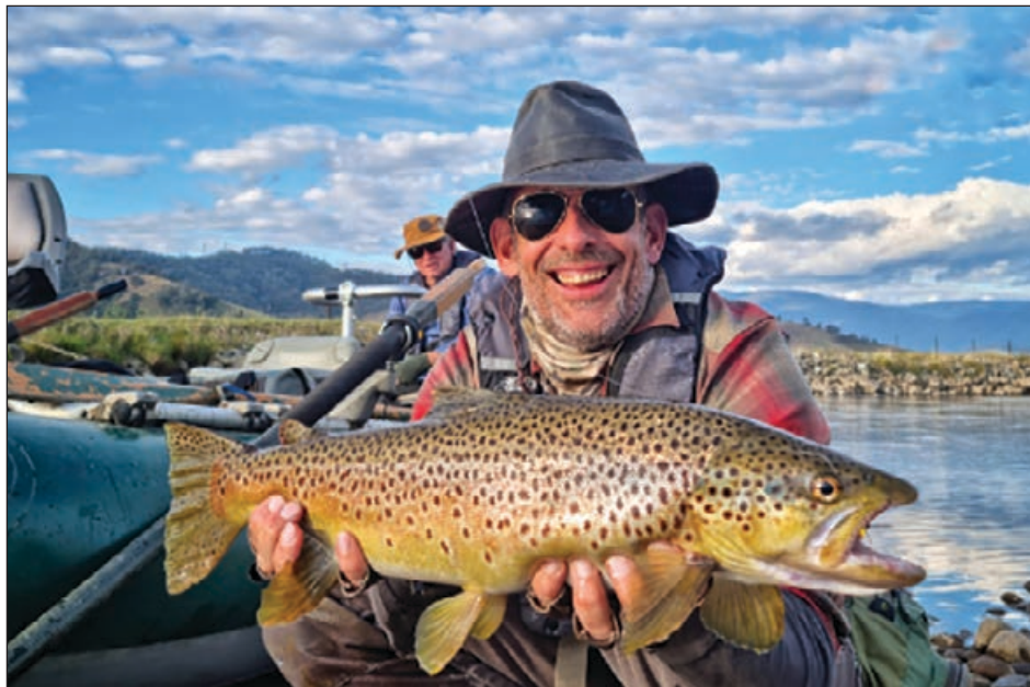
The Swampy delivers again

bit of water that runs into the Murray has now had fish go up it.