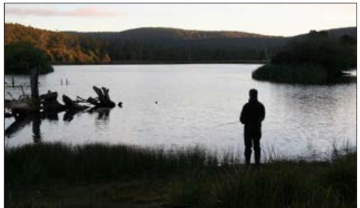
Sunset at the popular Currawong Lakes in Tasmania