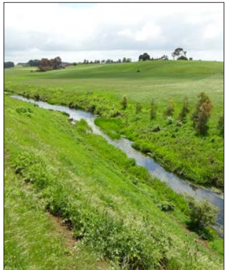
The Merri River a long way upstream