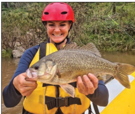
Bass from the Snowy

And it's basically the playground where we take our clients. So I spend a lot of time there at Khancobin every year drifting the Swampy with clients. With our clients we fish up into the upper Murray area, into the Kosciuszko