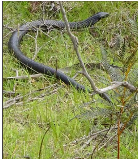
But look out for the Joe Blakes!