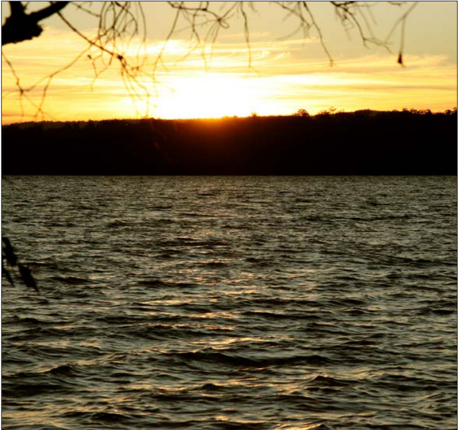
The summer sun setting on the fabulous Bronte Lagoon

pattern some thought, and make sure it's reaching the riverbed quickly enough. If nothing works, try a dry fly for a bit just to ring the changes. (A little dry fly fishing between nymphing is like a sorbet between courses. It clears the mind, rather than the palate.) Or get horizontal for a while in the shade of a willow to see if the mood of the fish won't improve. From firsthand experience, it mostly doesn't, though occasionally getting horizontal on a lazy river has a lot going for it anyhow.