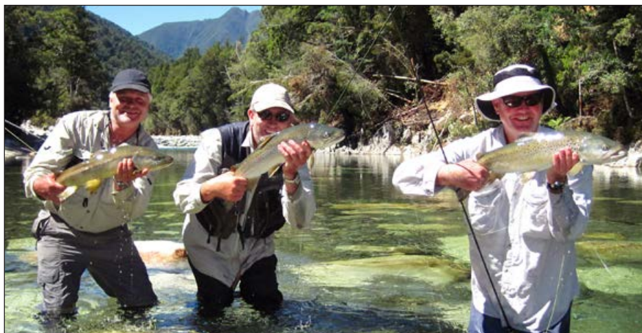
fishing New Zealand's South Island