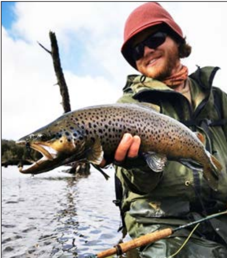
A Tassie brown – hard to beat

Camden Dam is a great choice if you want to avoid the crowds and don't mind doing a bit of wading or can take your kayak for a paddle. Plenty of fish are getting caught on small black wet flies. This is great lake to fish with a floating line along the shores. If you are willing to do some walking around the shore you will find lots of fishy bays and corners.