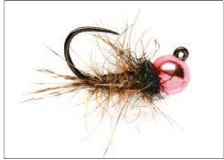
Ammunition – two popular nymphs

Mind you, even this tame activity has its traps. I recall an evening some years ago now when took a rod and a shopping bag with two or three reels up to the oval for a bit of relaxing practice when a lady with a dog of some foul breed came wandering across the grass. The dog raced up to my bag of reels, cocked a rear leg, and emptied a fairly full bladder on the contents. The owner immediately defended the dog – it was all my fault for not closing the bag properly. Ah well, the lines could do with another good wash and the reels needed a drop or two of grease.