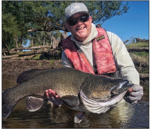
They do grow bigger than this!

And then that magic time of year for us who live up in the bush when Parks decide to open the gates and let us in. We all try to get in early before the mad rush of Melbourne anglers. So those gates are opened. They're management gates, and