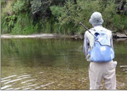
Drifting a nymph in the current

won't live up to the reputation for near-instant gratification you'd heard about.