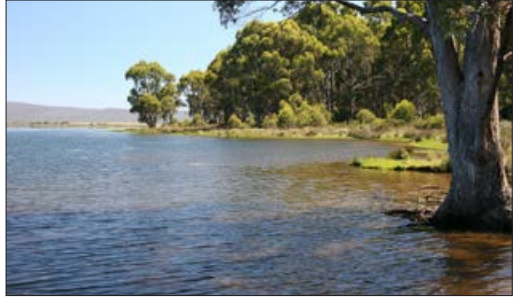
Attractive water on Bronte Lagoon

For further details on other waters and what to use, come in to our store and check the hatch board, or give us a call. Tight Lines!