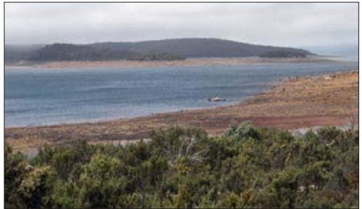
The Great Lake – a very large and imposing trout water