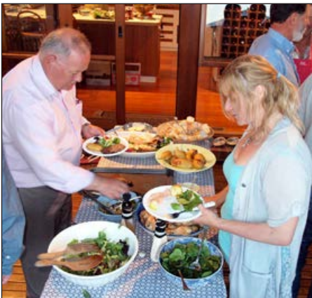
The traditional evening barbecue at the Blakeslee's property