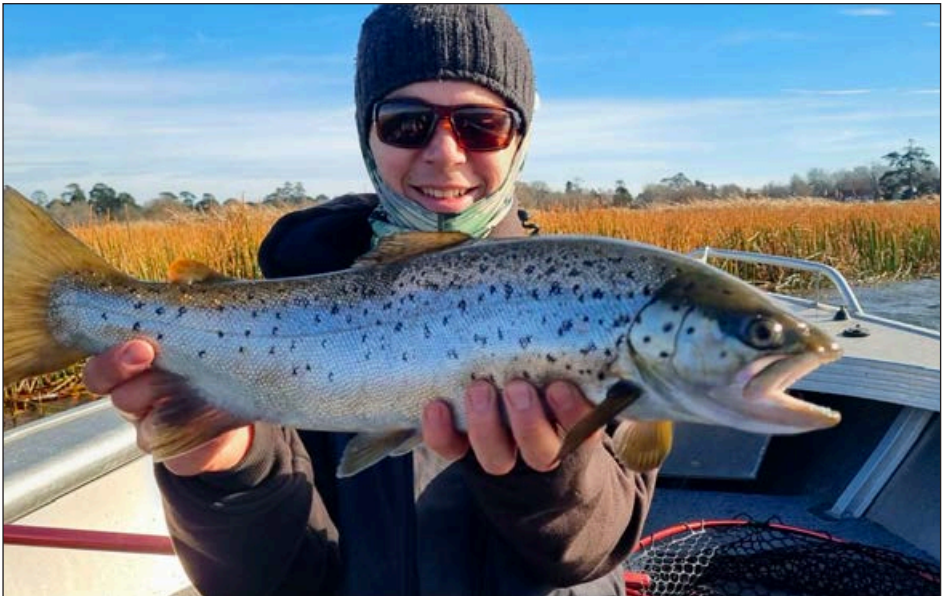
A superb brown from a Ballarat lake

That evening all members visited the Ballarat Fly Fishers Club rooms on Lake Wendouree to expedite some male bonding over a frothy or two. This is one of the highlights of the trip. It is great to spend time socially with like-minded people and discuss the next day's prospects.