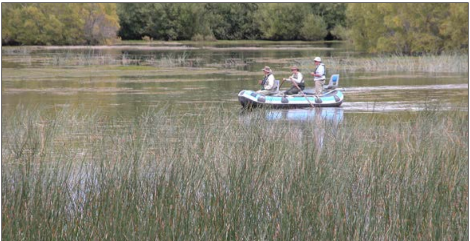
Fishing Brumbys Weir in Tassie