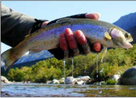
A rainbow trout from a South African river"

and to take root a little, though I don't want to leave you with the impression that you're a day off becoming a master. Those who know will say it's only the start of what, from then on, is a lifelong learning curve in what undoubtedly is one of the most exciting and rewarding aspects in all fly fishing. Exact, pinpoint, needle-sharp nymphing is the most valuable ticket there is to a lot more trout.