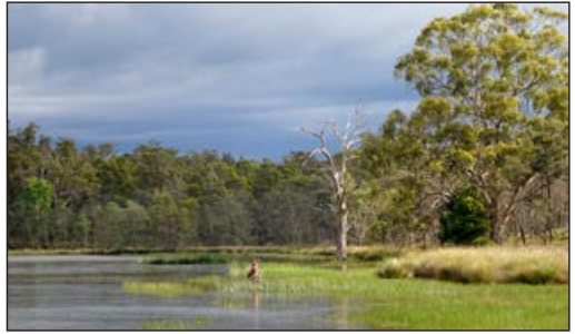
Four Springs – a very popular trout water in Tasmania