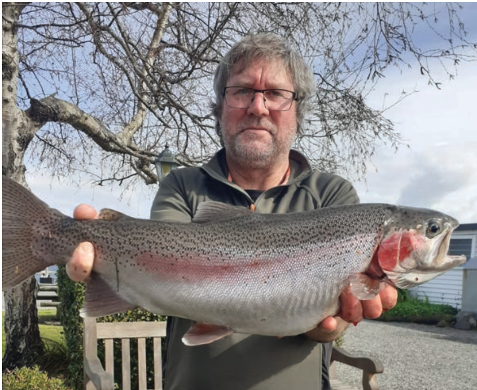
Those New Zealand North Island trout do grow large