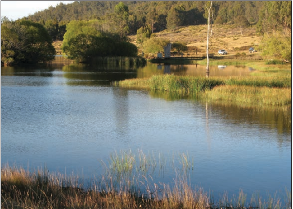
Currawong is a very attractive and arresting trout fishery