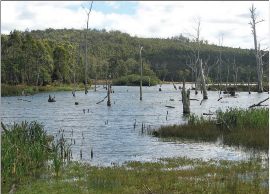
The top lake at Currawong has a very large trout population

Guides: Guides are available on request. Book direct through Currawong, in advance.