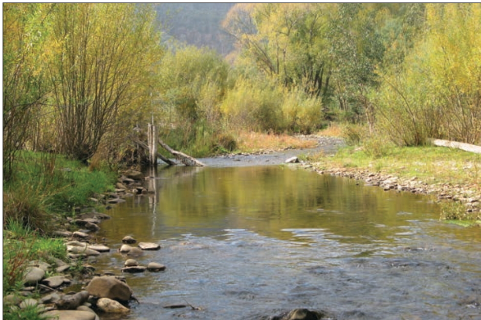
The Ovens upstream from Bright – a very attractive trout stream

I've not yet mentioned river conditions. Ideally we are heading out to fish a river that is at normal height, clear, and at a sensible temperature. My understanding is that water temperatures in the range 14°C – 17°C are ideal to see trout in the feeding mood.