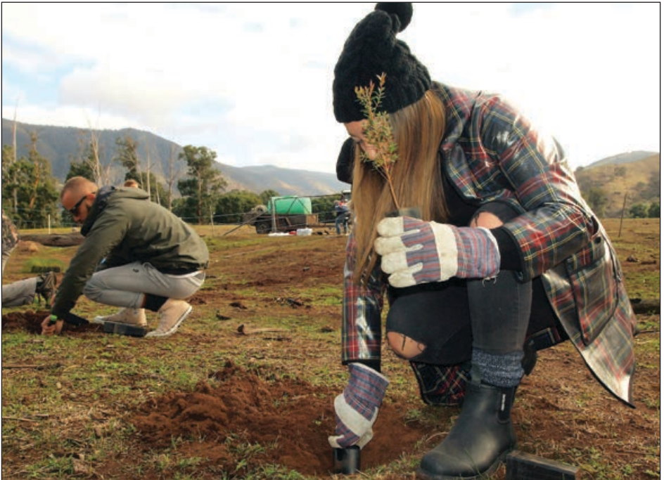
The Australian Trout Foundation has organized countless stream-improvement projects, many involving tree-planting along our better trout streams

Volunteers should bring sturdy boots, gloves, work clothing, refreshments, and fishing gear.