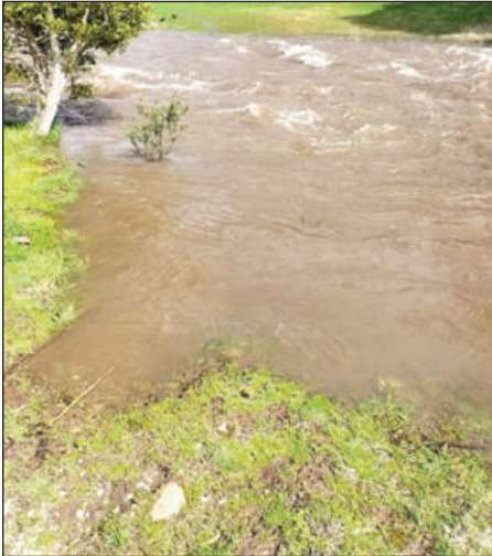
Brian's photo of the current condition of the Ovens River. It will be some weeks before it clears and drops and becomes fly fishing friendly